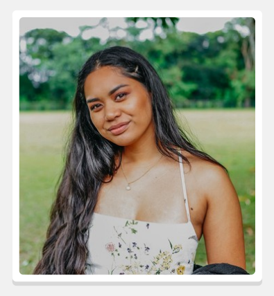
PRE K ASST & ART TEACHER