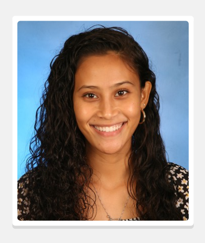
K5 & 2ND GRADE ASSISTANT